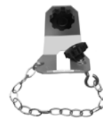
Mounting bracket BBG