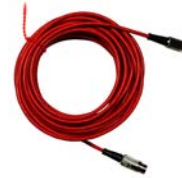
Photocell cable 001-30