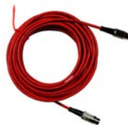
Photocell cable 001-10