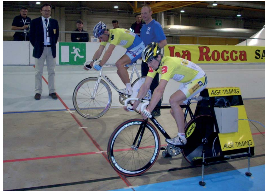
Cycle is locked at saddle and at the back wheel as well as a stand stabilizer at the back wheel