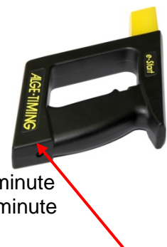
Charger socket for charger PS12A