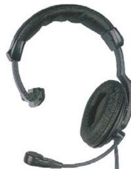
ALGE Headset HS2-1