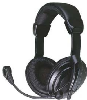
ALGE Headset HS2-2

It is possible to connect a headset from ALGE. The speech amplifier is built into the LA5. If you have on the other side of the cable connected to “line” (8) a timing device with a headset, than you can communicate. The impulse transmission and the speech transmission is on the same cable.