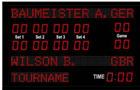
D-S10SQUASH RTDM100-7x120+RTDM-7x50 Characterheight: 100mm Dimensions: 1500x950mm