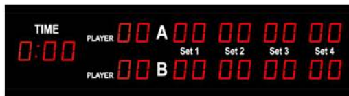
D-S10SQUASH2 Characterheight: 100mm Dimensions: 1700x450mm Version 2