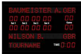
D-S57SQUASH RTDM50-7x120+RTDM50-7x50 Characterheight: 57mm Dimensions: 900x600mm

The following different scoreboards are available