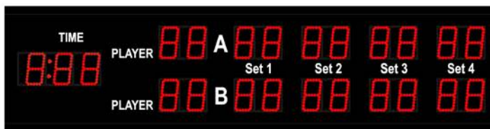
D-S15SQUASH2 Characterheight: 150mm Dimensions: 2350x600mm Version 2