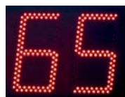
Digit with 250 mm figure height