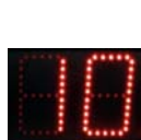
Digit with 150 mm figure height